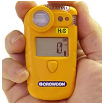
Figure 2: Personal hydrogen sulphide detector