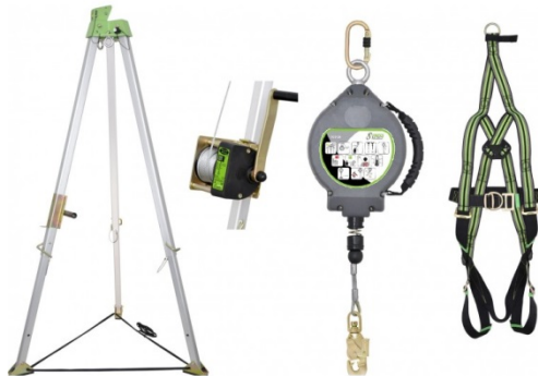
Figure 5: Tripod; winch; full body harness

If the confined space requires vertical entry, and there is not a fixed ladder, a davit arm or a tripod is necessary. A tripod is a recommended for task-specific work such as manhole entry. Tripods easily are set-up by one worker and can be transported from one location to another. One limitation of the tripod is the size of the opening it can accommodate.