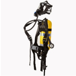
Figure 3: SCBA

SCBA mask provides the wearer a well-equipped environment with fresh air delivered to the mask breathing air from a tank. The air tank, which is under high pressure, usually will provide enough air up to an hour, but a larger version available last longer. This is required under circumstances where there is no safe air supply available, and where the operator must be provided with a safe supply of air to enable them to survive.